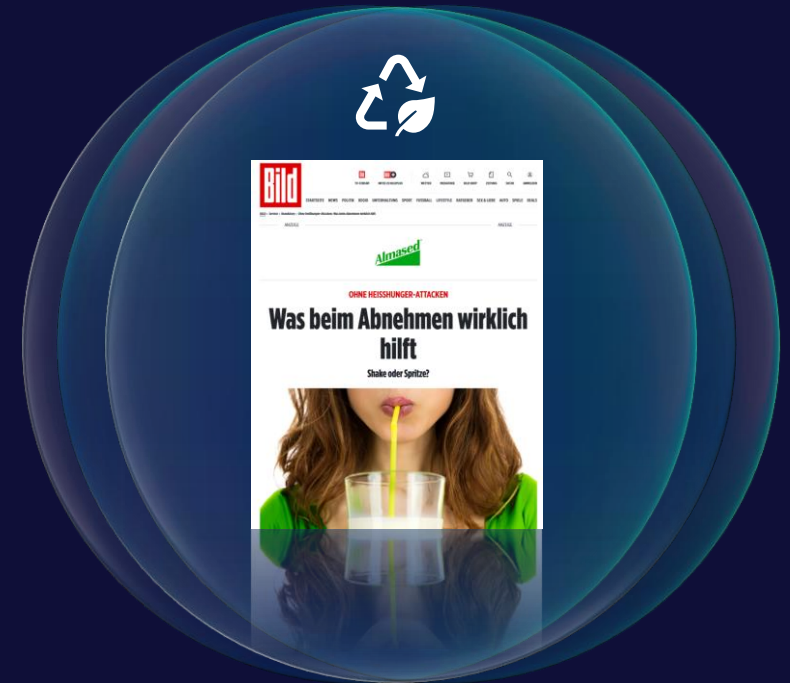
BILD Brand Story

The Refresh Story is an environmentally friendly and effective marketing strategy with reusable content ideas . Your message stays relevant, your ecological footprint stays small!