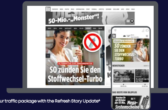
Your traffic package with the Refresh Story Update 4

Price according to booked views / booked product story package 2 + 500,00 € creation costs 3