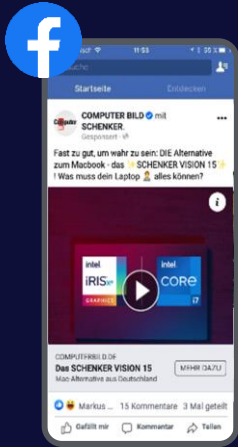
Facebook Sponsored Posts