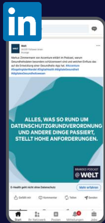
LinkedIn Sponsored Posts