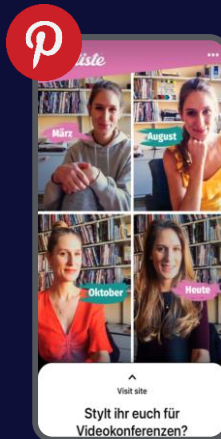
Pinterest Sponsored Posts