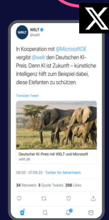
Twitter Promoted Tweets