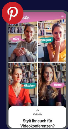
Pinterest Sponsored Posts