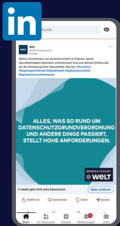
LinkedIn Sponsored Posts