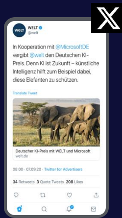
X (Twitter) Promoted Tweets