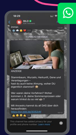
WhatsApp Posts or Instagram Content Posts (organic)