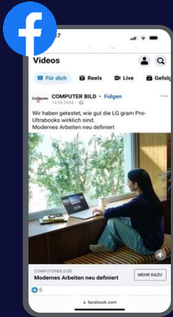
Facebook Sponsored Posts